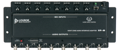
IF-8 AUDIO INTERFACE ADAPTER (eight audio inputs and outputs)