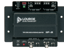
IF-2 AUDIO INTERFACE ADAPTER (two audio inputs and outputs)

After all microphones have been connected, bring other end of wiring to the IF-2/IF-4/IF-8 location and connect each microphone to the terminal blocks of the unit marked A, B, C. Be sure to properly match wire colors. If using cable from other manufacturers, color code may vary.